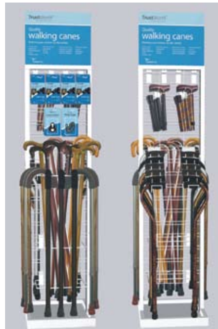
Both sides shown of two-sided display